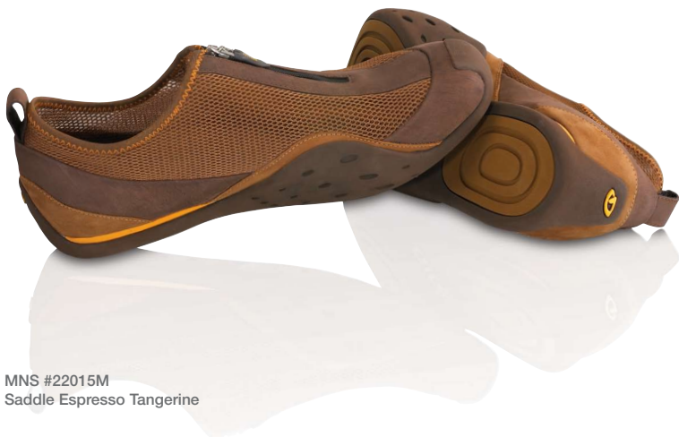
MNS #22015M Saddle Espresso Tangerine

It's no sweat. The easy-going Gava features a breathable 3.D Mesh upper and a secure, locking zipper. N-Shoc™ architecture has a nested N-Flexion™ midsole to manage heel impact energy. The high-traction, molded rubber outsole is durable enough to go for miles and gives superior lateral support. Made with Organix Fit™ engineering for all-day comfort.