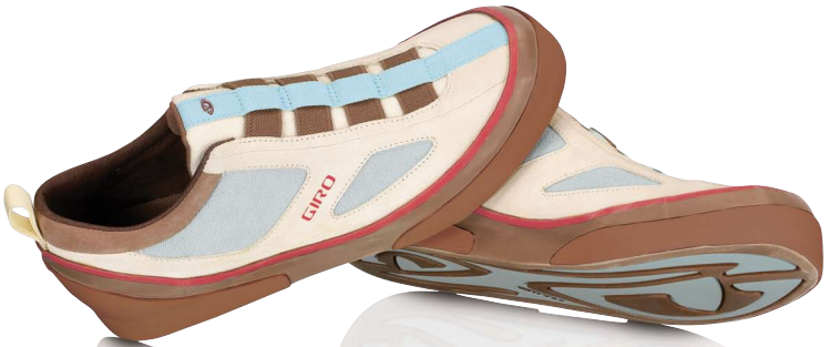
WOS #23030W Haze Bisque Cayenne Saddle