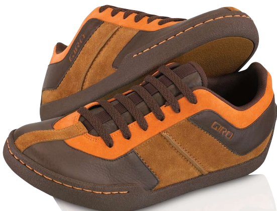
MNS #23043M Tangerine Walnut Saddle

On the quiet side of style. Ollie G has a molded rubber outsole featuring a crêpe-texture finish. The all suede and leather upper is breathable, and since it's made with Organix Fit™ engineering to say it's comfortable would be an understatement.