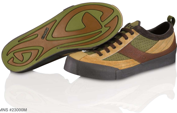
MNS #23000M Olive Dune Saddle

A mod tweak on a classic style. Monte G features a soft, suede and full grain leather upper. High traction, durable vulcanized rubber is heat-fused to the upper for a stronger, lighter, cement-free bond. Made with Organix Fit™ engineering for plush comfort all day and all night long. Available in a full range of smokin' colors.