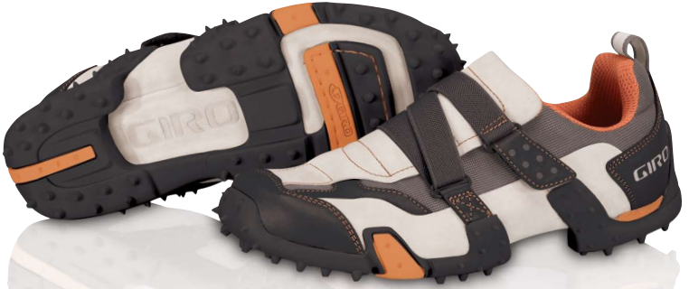
MNS #22025M Black Putty Sienna