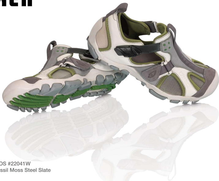
WOS #22041W Fossil Moss Steel Slate

Centered. Controlled. And a bit obsessive. With our adjustable Roc Loc ® strap and a quick-release, hook-and-loop tab, good karma comfort is no problem. Designed with N-Shoc ™ architecture featuring an N-Flexion ™ cushion to sooth your sole. Full grain leather upper features a cut-away design with a breathable mesh lining that reduces weight. High-traction, durable, molded rubber outsole features cool lug tread. Made with Organix Fit ™ engineering for a nirvana-like fit.