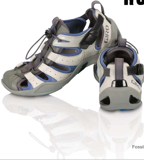
WOS #22008W Fossil Capri Steel Slate